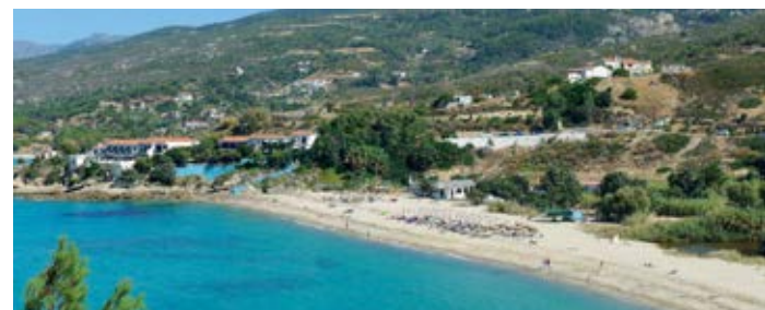
Livadi Beach and location of Valeta Studios (far end)

The Studios: Self Catering Studios for 2/3 Family Units for 4/5 Free WiFi